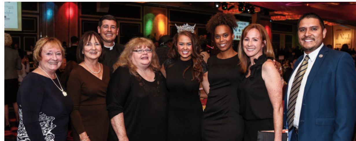
AC Day Nursery Members with Miss America 2018 Cara Mund