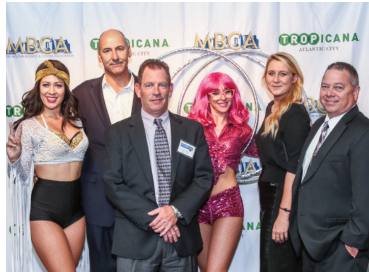
Bronze Sponsors ANCERO with Boogie Nights entertainers