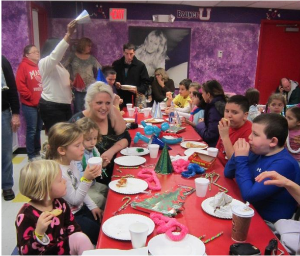
Bounce U was the perfect place to ring in the New Year for our FACES families a few days early.